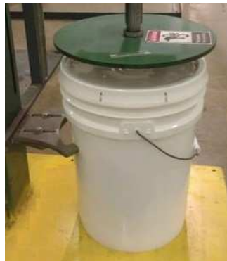
Figure A: Pneumatic Press