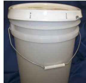
Improperly seated M2 lid: