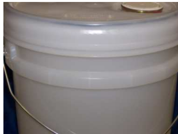
Properly seated M4 lid: