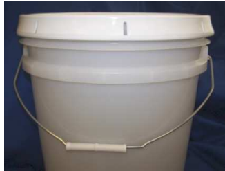
Properly seated M2 lid: